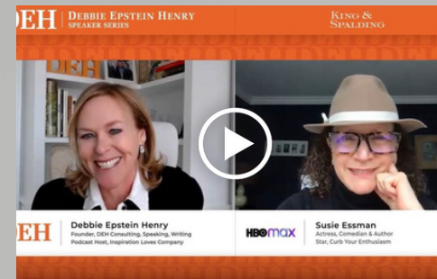
Women & Comedy with Susie Essman