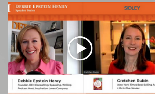
Life in Five Senses with Gretchen Rubin