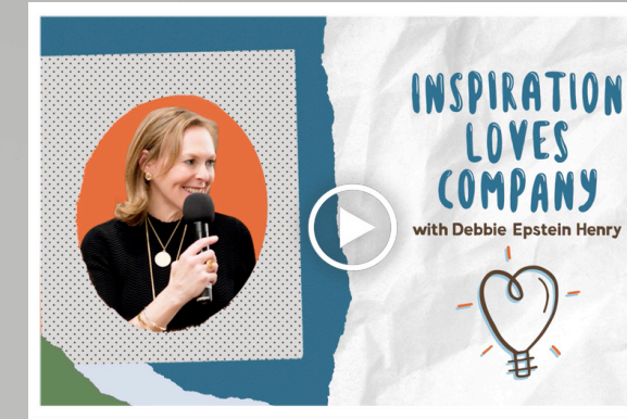
Inspiration Loves Company Podcast Trailer