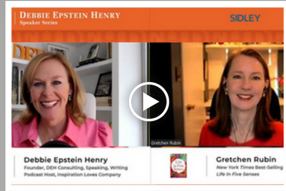
Life in Five Senses with Gretchen Rubin